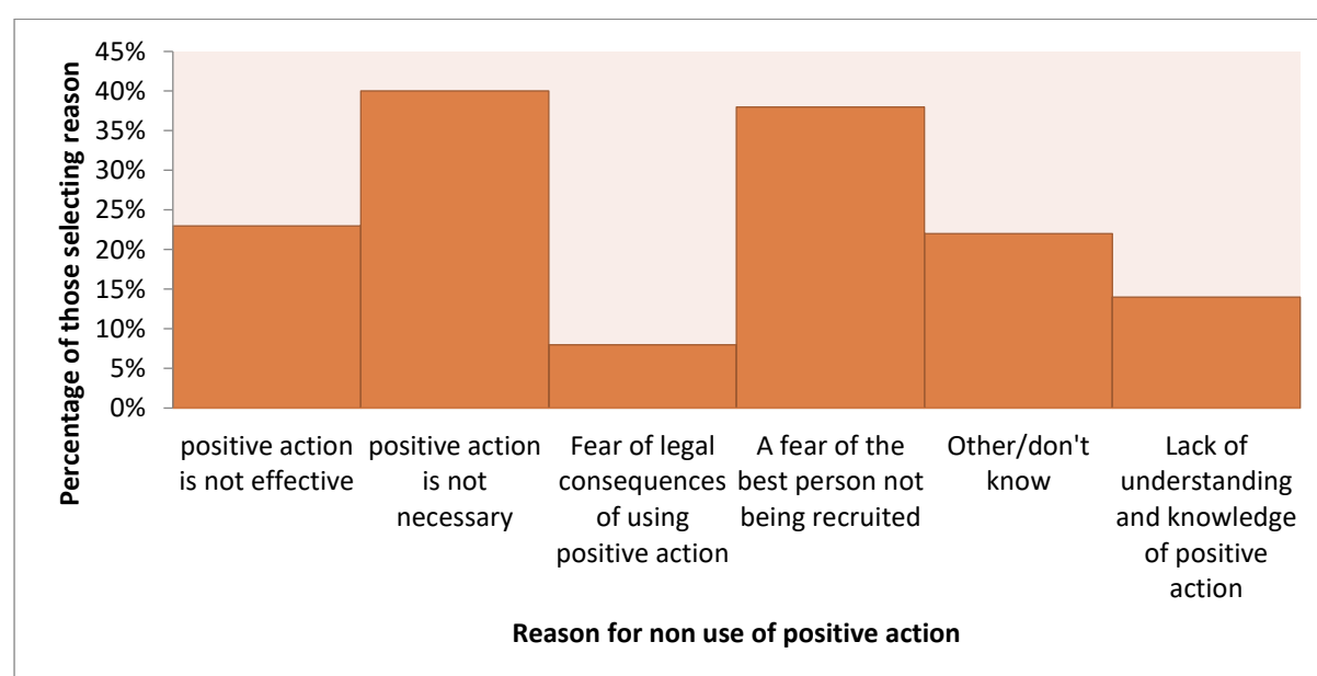
FIGURE 3: Reason for non-use of positive action by employers (Employer Survey)

For those respondents to this question in the Employer Survey who gave 'other' as a reason for non-use of positive action, limited qualitative responses were sought from these respondents. Sixty-one respondents overall provided wider reasons for non-use of positive action. Perhaps unsurprisingly, the majority of these respondents (54%) stated that they would not seek to use positive action due to the small size of their organisation, the lack of any potential to recruit further or the fact that they did not have a recruitment function within their organisation. Less prominently, 11% of respondents stated that they would not seek to use positive action as they recruited on merit irrespective of individual characteristics. The majority of these were male respondents: